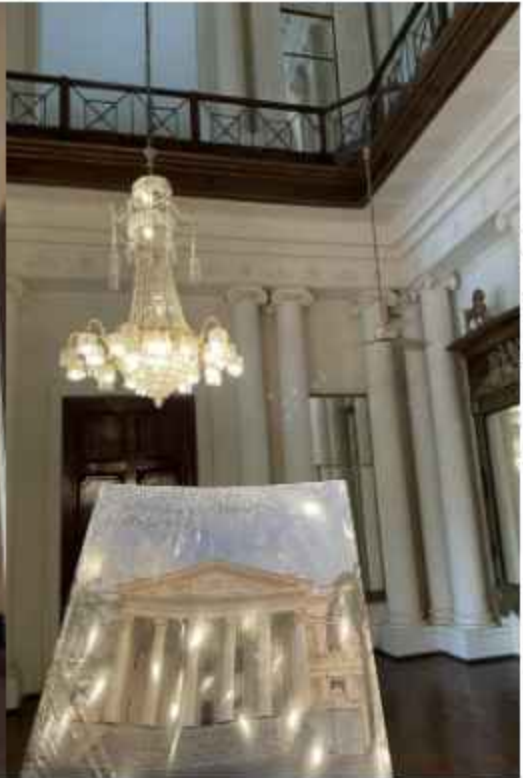
SITE VISIT TO BRITISH RESIDENCY WITH CONSERVATION WORKSHOP