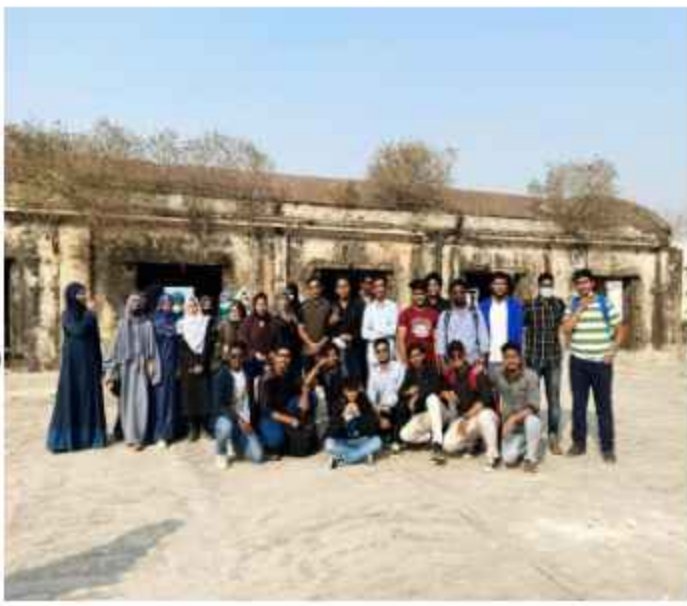
SITE VISIT KHUR SHEED JAH BARA DRI