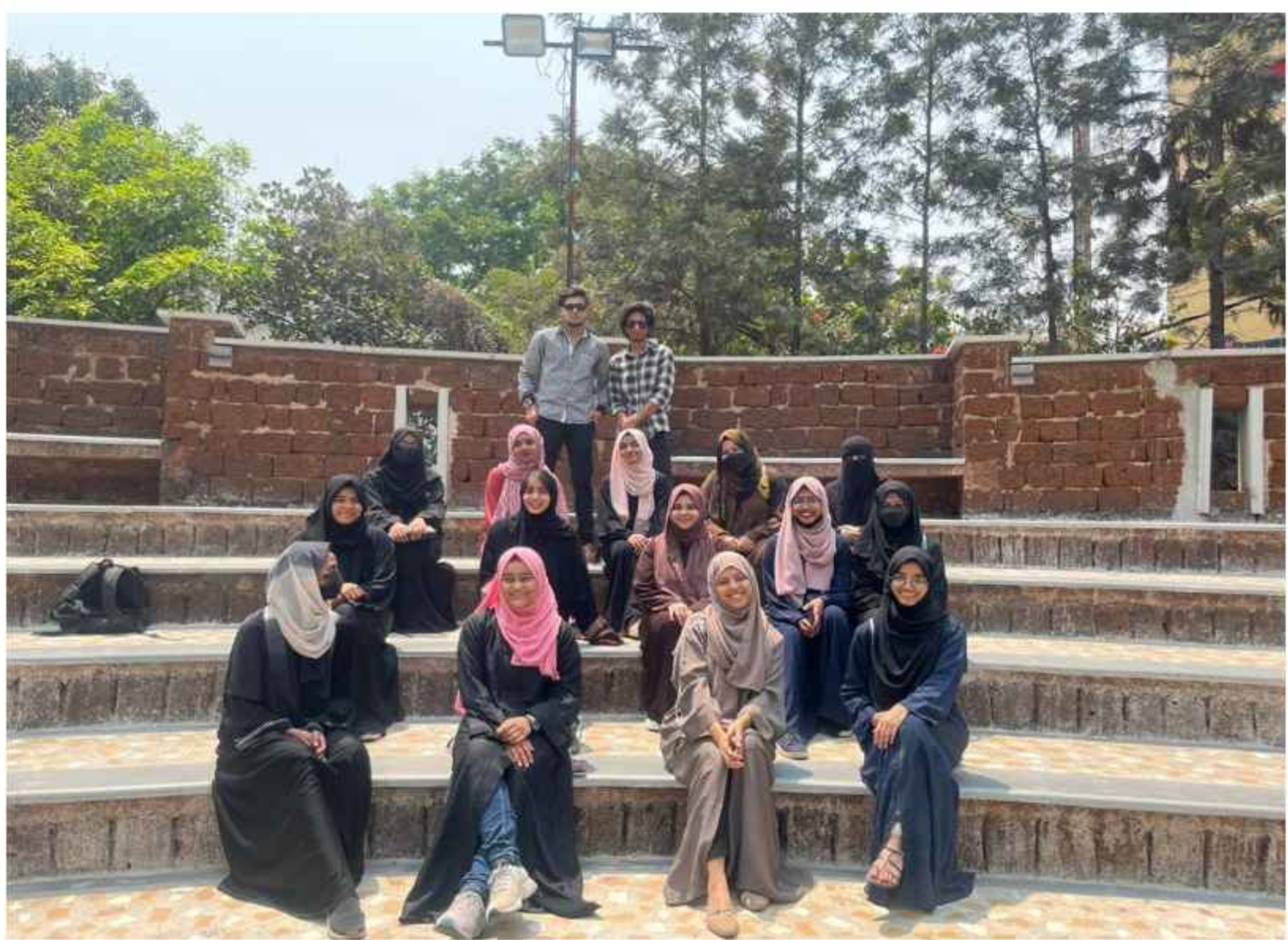
CULTURAL CENTRE VISIT