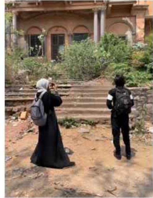
SITE VISIT TO IRUM MANZIL