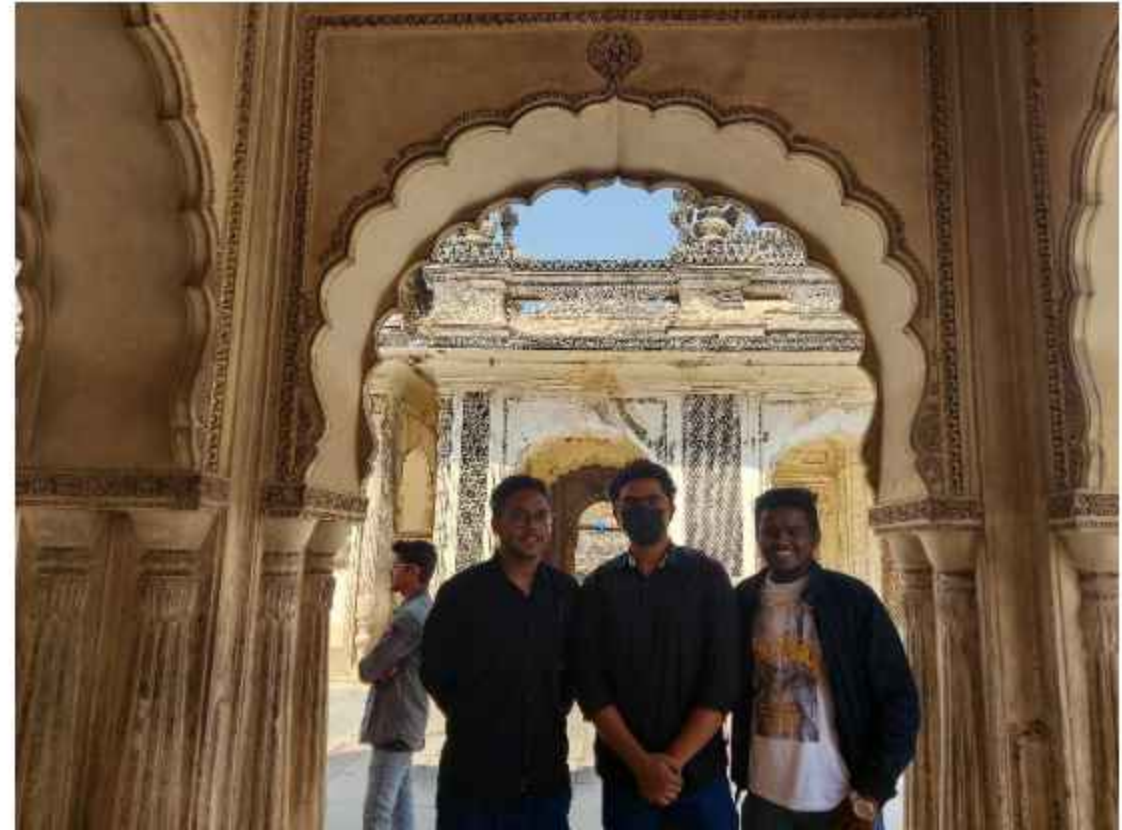
HERITAGE WALK AT THE PAIGAH TOMBS