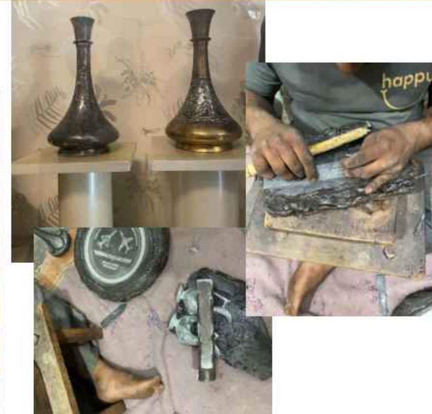
WORLD HERITAGE WEEK CELEBRATION TRIP TO BIDAR